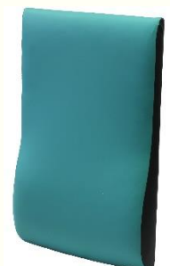
Frame base for modular design.