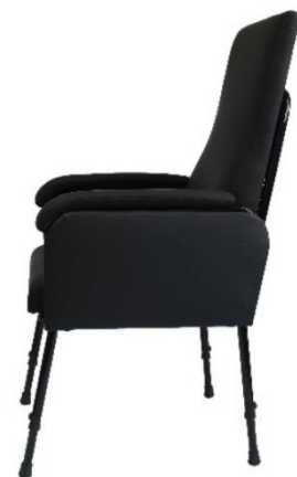
AC4 & Armrest Infills